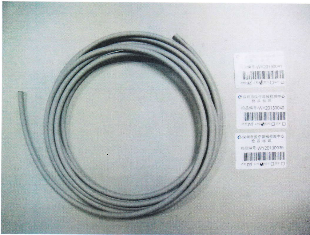
Fig.2 Test article (Blank Below)

All raw data pertaining to this study and a copy of the final report are to be retained in designated archive files in our testing center.